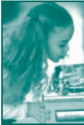
Wetlands improve water quality in rivers and streams. they are valuable filters for water that may eventually become drinking water.

Wetlands improve water quality in nearby rivers and streams, and thus have considerable value as filters for future drinking water. When water enters a wetland, it slows down and moves around wetland plants. Much of the suspended sediment drops out and settles to the wetland floor. Plant roots and microorganisms on plant stems and in the soil absorb excess nutrients in the water from fertilizers,